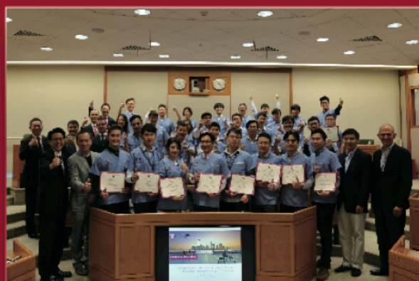
Class of 2016