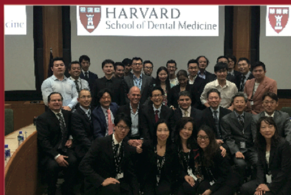
Class of 2015